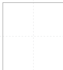
Step 1: Cut out around outline

This PDF is designed to fit in your camera carrying case. Simply print it out, then trim and fold along the lines to create your very own handy reference guide.