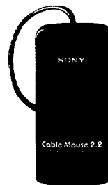
OPTIONAL CABLE MOUSE DSS/CABLE BOX CONTROLLER*