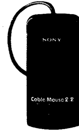
CABLE MOUSE DSS/CABLE BOX CONTROLLER