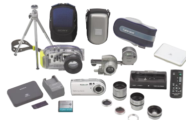
CAMERA WITH OPTIONAL ACCESSORIES

CSS-PHA Cyber-shot Station ACC-CFR Starter Kit NP-FR1 InfoLithium® Battery BC-TR1 Compact AC Travel Charger VAD-PHB Conversion Lens Adaptor Mount VCL-DH0730 Wide Angle Conversion Lens* VCL-DH2630 Super Telephoto Conversion Lens* VCL-DH1730 Telephoto Conversion Lens* HVL-FSL1B External Slave Flash w/ Bracket MPK-PHB Marine Pack LCM-PHA "Just Fit" Carrying Case LCS-CSD General Carrying Case VCT-MTK Travel Tripod LCH-MA Memory Stick® Media Carrying Case MSA-32A, MSA-64A, MSA-128A Memory Stick® Media MSA-128S2 Memory Stick® Media with Select Function (256MB total) MSA-256, MSX-512, MSX-1G Memory Stick PRO™ Media MSAC-US30 Memory Stick PRO™ Media USB Adaptor *VAD-PHB Conversion Lens Adaptor Mount Required